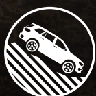
HILL DESCENT CONTROL

Everest's comprehensive Electronic Stability Control Program uses smart technology to help keep you in control of tough situations and prevent accidents before they occur.