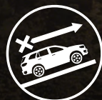
HILL LAUNCH ASSIST